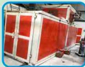
POWDER COATING MACHINE