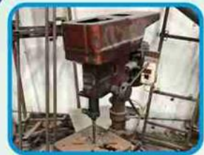
HEAVY DRILLING MACHINE