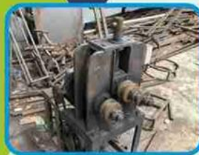
PIPE BENDING MACHINE