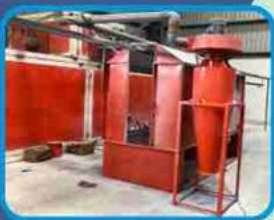
PAINT BOOTH MACHINE