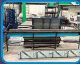
ACM BENDING MACHINE