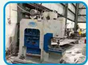
MULTI PURPOSE CUTTING AND BENDING MACHINE